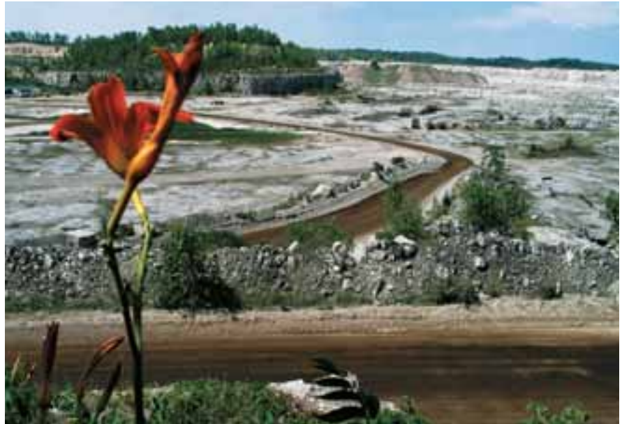
The rare Lakeside Daisy is currently known to exist at only two natural sites in the United States: Lafarge's Marblehead Quarry in Marblehead, Ohio, and in Mackinac County, Mich.

The character of each site is a reflection of the geology from which the reclaimed site was formed, and the nature of the mine operation that shaped the site. Some sites have been reclaimed as an integral part of the mining operation. Many were devel-