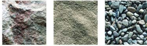
Natural building blocks for quality of life